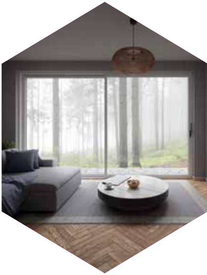
Prestige LIFT & SLIDE PATIO DOOR

Up to 31% slimmer than market competitors, our multi-track aluminium lift & slide Patio combines flawless minimalism with exceptional thermal performance.