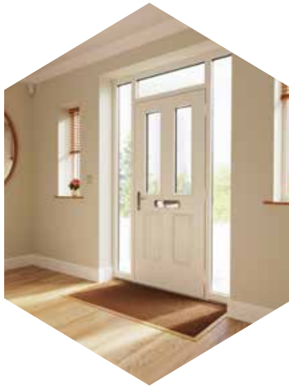
Prestige COMPOSITE DOOR FRAME

Available in stepped and contemporary styles, the Prestige Lift & Slide Patio perfectly matches the rest of the Sheerline range.